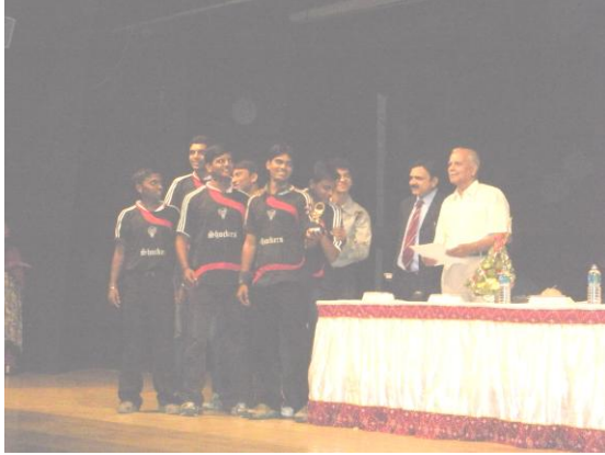
Winner of Volleyball (MCA III) in Rainbow 09