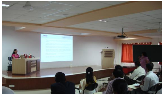
Aftek team on MCA placement drive

On 24 th July Aftek conducted the Aptitude test for MCA 3 rd year students under the common placement activity where 5 MCA Institutes