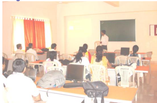
Project presentations by MCA 3 rd year students

MCA 5 th Semester students have started their scheduled mini project presentations from 6 th August 09. Students were asked to give the first presentation on synopsis basically covering the designing of project in front of project Guides & experts.