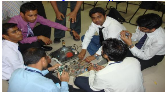
MCA- 1 Students busy in learning Computer Organization with fun

MCA 1st year students took active participation in learning the Computer Organization with innovative way. Students