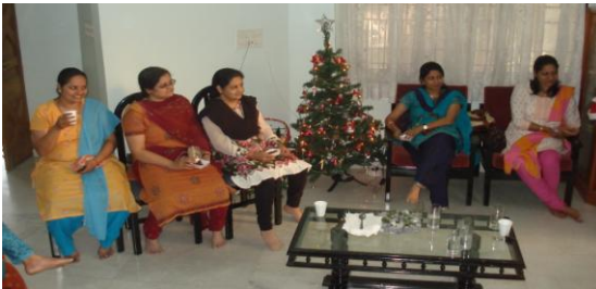
Christmas Celebration by IICMR staff