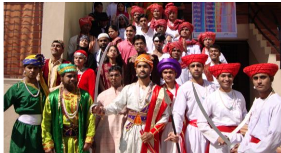
MCA Students celebrating traditional day