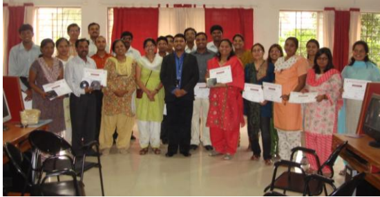
FDP participants with certificates issued by IBM

awarded with IBM Certified Associate Developer Certificate (Rational Application Developer for WebSphere Software 6.0). The minimum passing criteria was 67%.