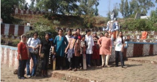
Faculty Picnic at Nilkantheshwar

IICMR faculties went for Picnic on 19 th Dec.2009 to Nilkantheshwar which is situated 100 km from Pune. All of them enjoyed 2 Km climbing/ tracking the Nilkntheshwar hills.