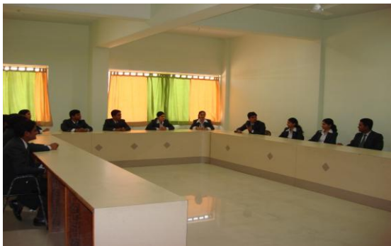
Students busy in Group Discussion

The MCA department arranged several Aptitude & Technical training workshops along with personality development sessions for MCA 2 nd year students to face the Industry challenges during the campus recruitment.