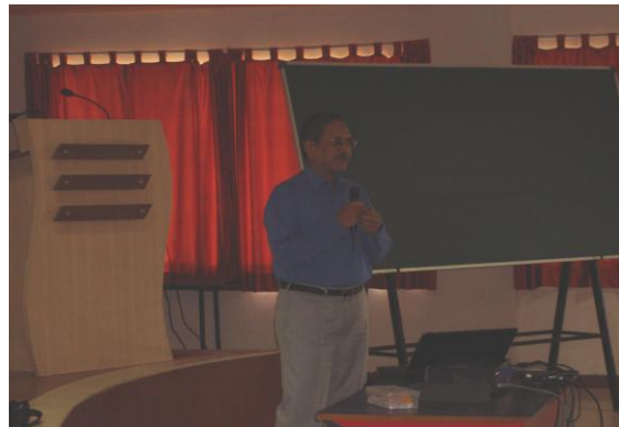
Mr. Vivek Deshpande, Rtd. Commissioner, Intelligence Bureau, Govt. of India

A Seminar was delivered by Mr. Vivek Deshpande Rtd. Commissioner, Intelligence Bureau, Govt. Of India on topic "National Security, Terrorism & Citizens Role", on 2 nd February 2009.