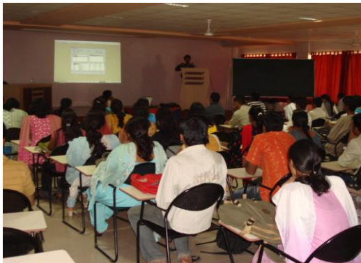
Mini Project Presentations given by MCA 3 rd year students to MCA 1 st & 2 nd year.

The department arranged senior-junior student interaction programme in which MCA 3 rd year students presented their mini projects in front of MCA 1 st year & MCA 2 nd year students. The basic objective of this was to bring about project awareness.